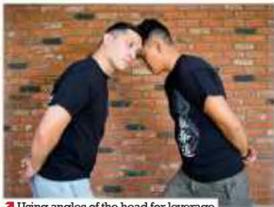
➤ Using angles of the head for leverage

closest to him while yelling "F**k you!". The more aggressive the better.