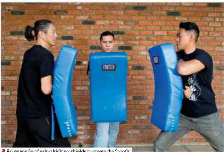
➤ An example of using kicking shields to create the 'booth'